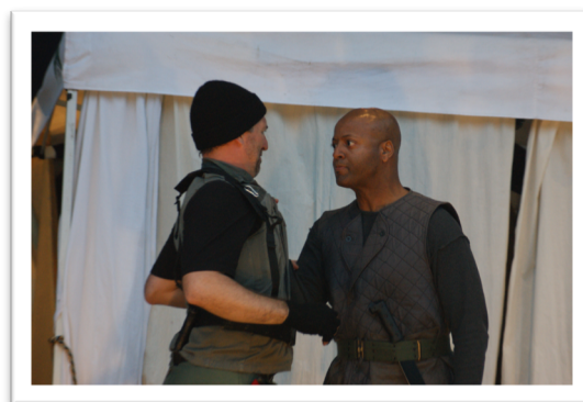
Army Veterans perform a scene from Othello .