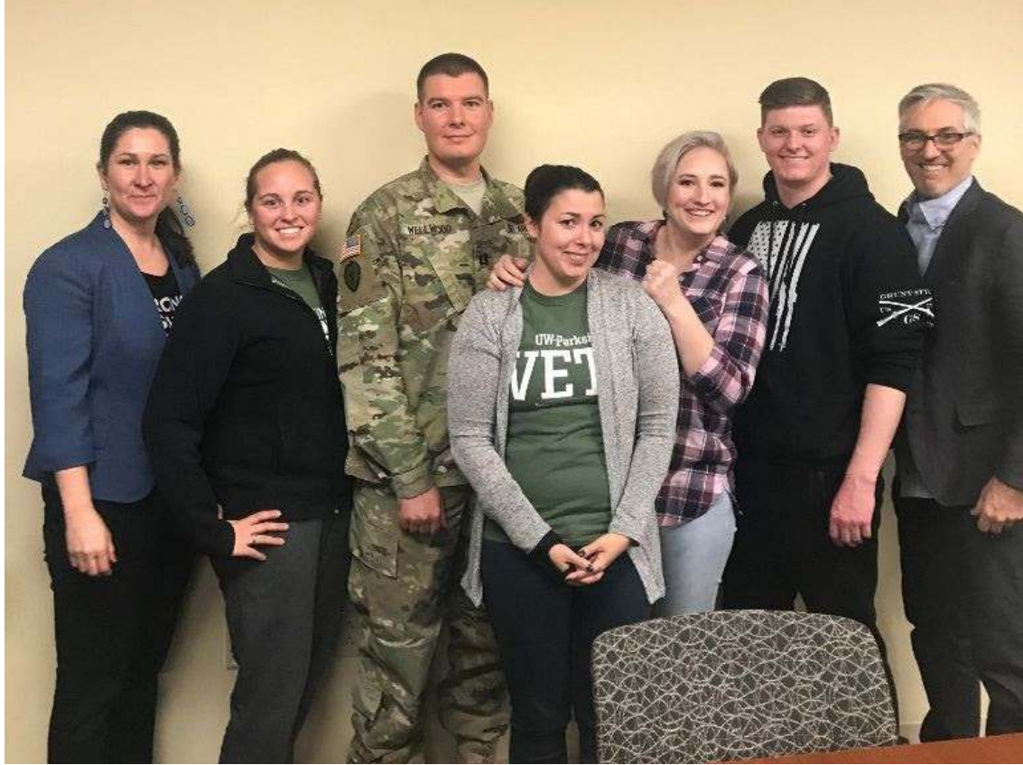
Above: Veterans and faculty from UW-PARKSIDE