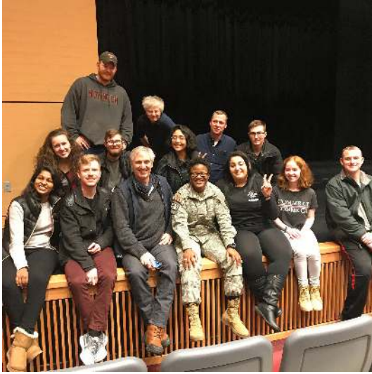
Students and Cadets at Norwich University.